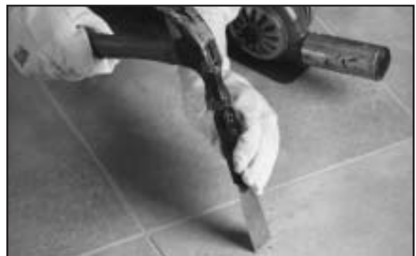
Fig. 9. Drive a putty knife into the heated area and pry upward.