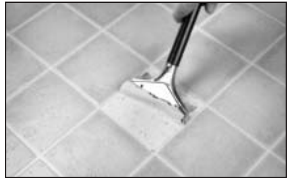
Fig. 5. Remove backing from repair area down to subfloor.