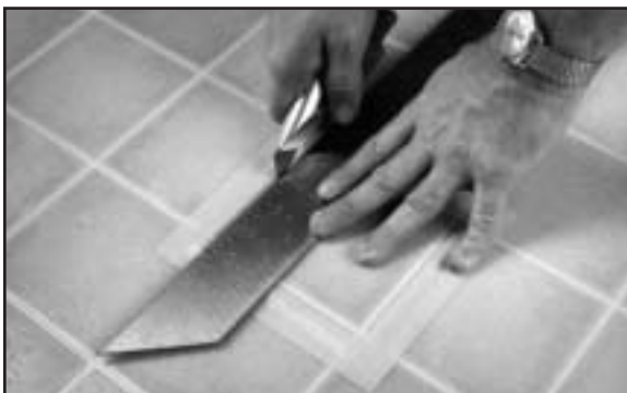
Fig. 3. Apply enough pressure to cut through both layers of flooring.