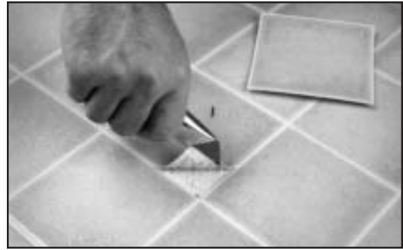
Fig. 4. Remove damaged spot.