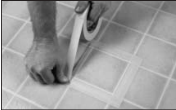
Fig. 2. Match the design and fasten in place with masking tape.