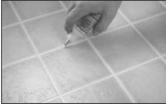
Fig. 7. Seal seams with the recommended seam sealer.