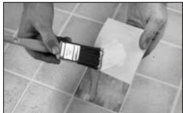
Fig. 6. Apply a thin coat of adhesive.