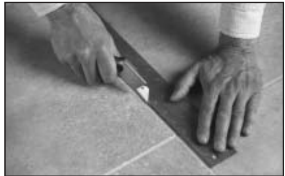
Fig. 8. Cut along the center of the grout line after heating it.