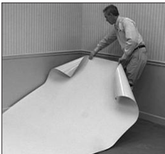
Fig. 1. Unroll with vinyl side down.