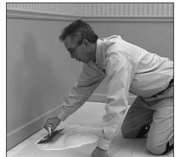
Fig. 4. Apply adhesive and install Endurance Plank.