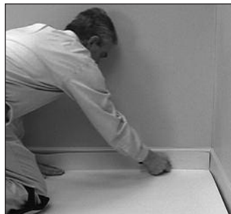
Fig. 2. Cut leaving 1/4" space at perimeter.