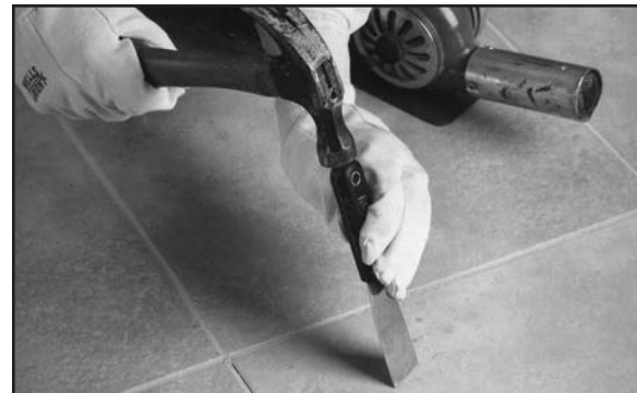
Fig. 183. Drive a putty knife into the heated area and pry upward.