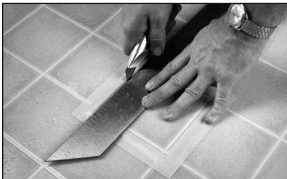
Fig. 177. Apply enough pressure to cut through both layers of flooring.