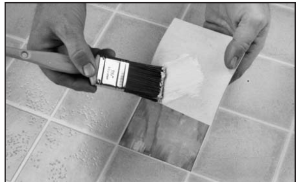
Fig. 180. Apply a thin coat of adhesive.