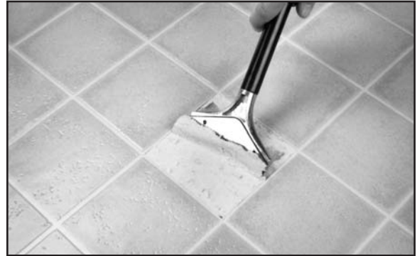
Fig. 179. Remove backing from repair area down to subfloor.