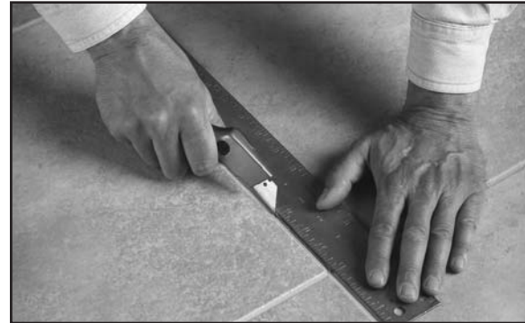
Fig. 182. Cut along the center of the grout line after heating it.