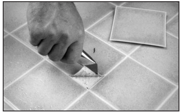
Fig. 178. Remove damaged spot.