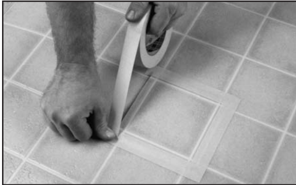
Fig. 176. Match the design and fasten in place with masking tape.