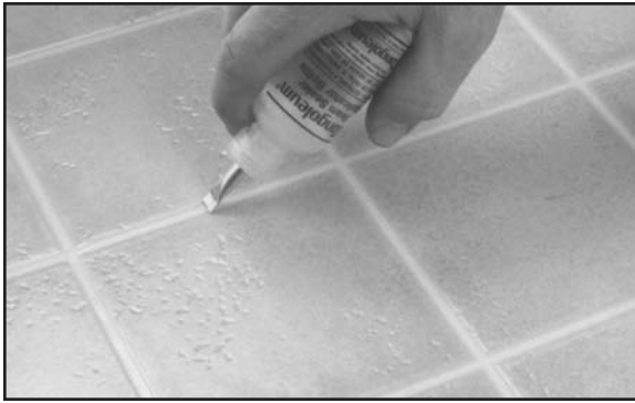
Fig. 181. Seal seams with the recommended seam sealer.