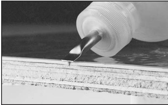
Fig. 41. Insert slotted fin into seam cut.