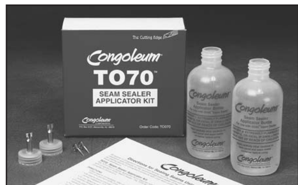
Fig. 36. TO70 Seam Sealer Applicator Kit