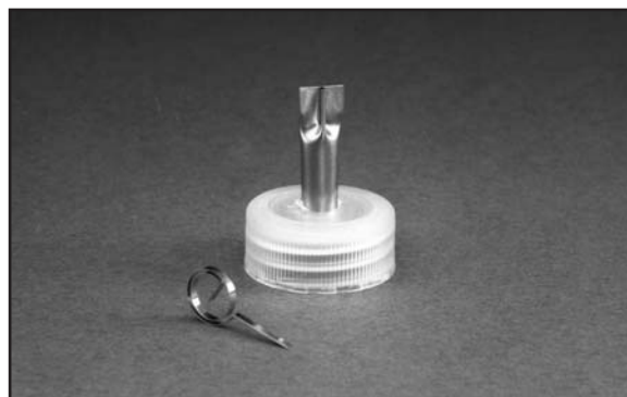
Fig. 40. TO70 Seam Sealer Application Nozzle.