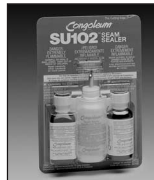
Fig. 37. SU102 High-Gloss Urethane Seam Sealer Kit