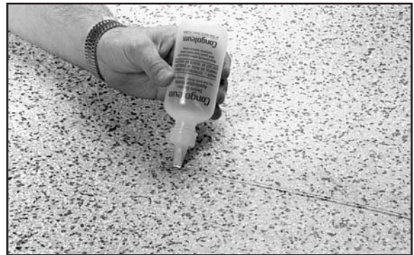
Fig. 42. Hold applicator bottle perpendicular to seam cut.

NOTE: Seam sealer applied to only one edge can result in seam failure. Check seams for proper seam sealer application.