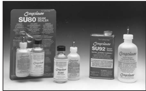
Fig. 35. SU80 and SU92 Seam Sealers.

One kit will be required for each installation with seams; excess seam sealer cannot be saved for reuse.